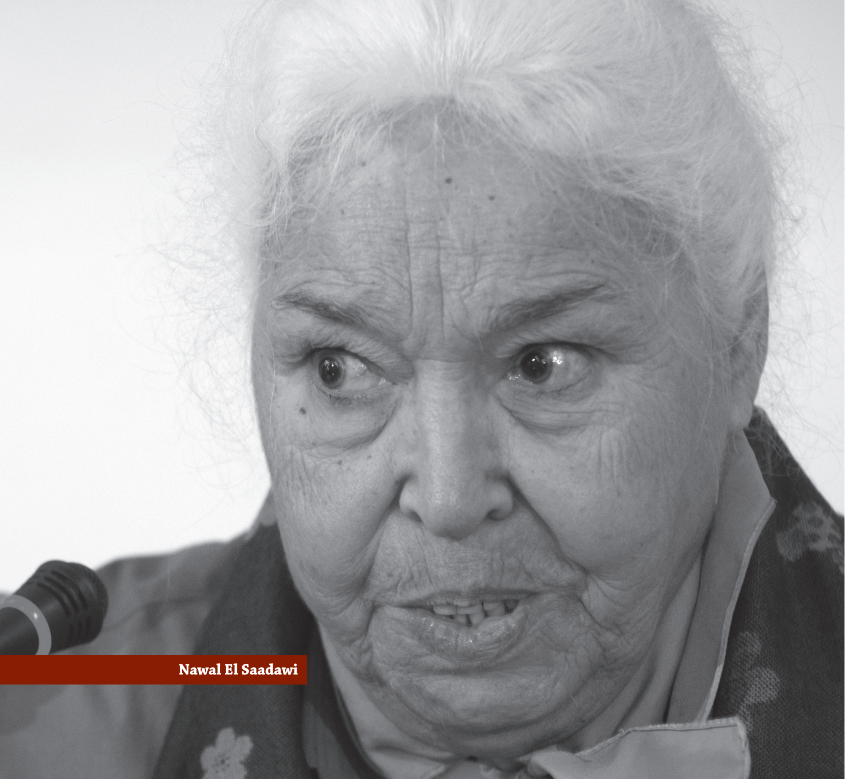
Nawal El Saadawi